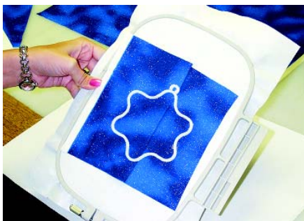
Return the hoop to the machine. Sew the satin stitch border of the outline of the ornament.