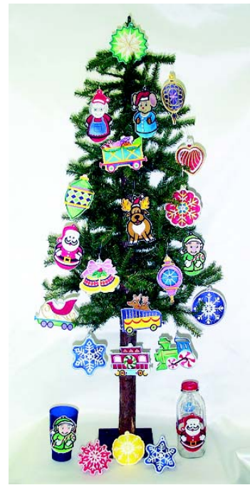
Freestanding appliqués can be used to create unique Christmas ornaments, coasters, and package decorations. At the bottom of the tree, two examples show how ornaments can be used to decorate cups or bottles or stuffed with fiberfill or potpourri for a three-dimensional effect.

An important note: You want to add the embellishment on the top piece before you sandwich the vinyl piece together because if you try to embroider