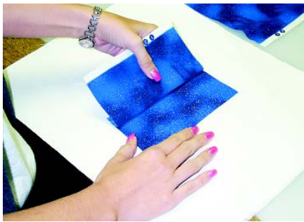
Fold over the left side of the top piece of fabric 1/2 inch. Crease or lightly press the folds in place. This forms a neater edge when closing the back.