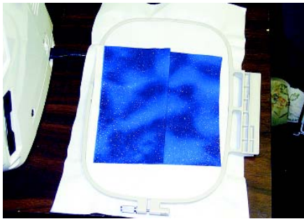
With the wrong side of the overlapped pieces of fabric facing up, lightly apply spray adhesive to the entire back side. Then place the fabric—adhesive side down—against the back of the hooped ornament. Lightly press down on the fabric to help seal the adhesive to the ornament.