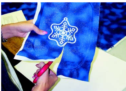
Remove the ornament from the hoop and carefully cut it out along the satin stitch border.

with the vinyl layer at the bottom, it has a tendency to unattractively scrunch up. By adding the vinyl last, you avoid this problem.